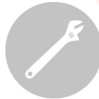
Plumbing & Heating